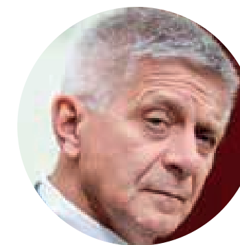
PROF. MAREK BELKA