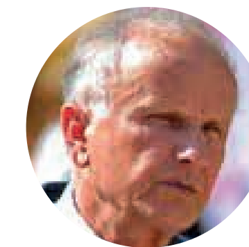
PROF. GRZEGORZ KOŁODKO